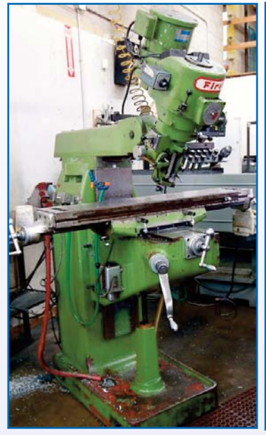
FIRST LC-18VA VERTICAL MILLING MACHINE ACU-RITE 2-AXIS DRO, 9" X 49" TABLE, ALIGN POWER FEED, S/N 77120738