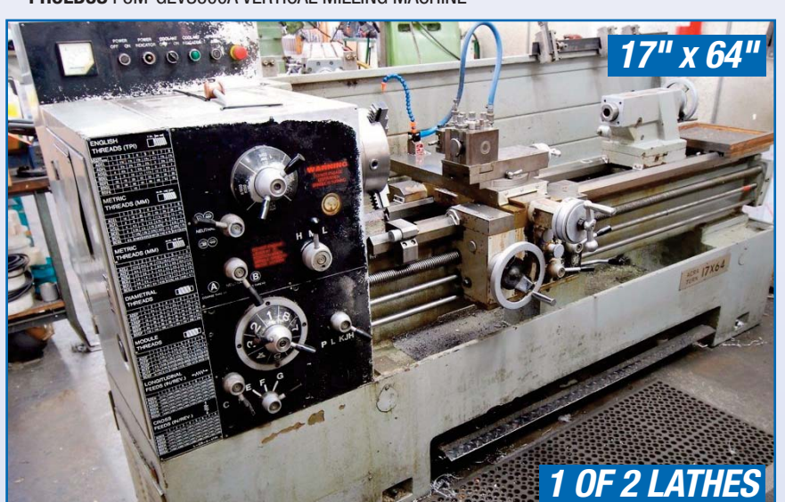
ACRA TURN ENGINE LATHE