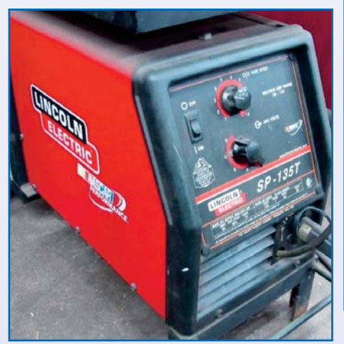
LINCOLN SP-135T WELDER

BROWN BOGGS NO. 6125 SHEAR, 3/16 GA X 10' CAP., BACK