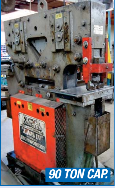
EDWARDS JAWS IV IRONWORKER