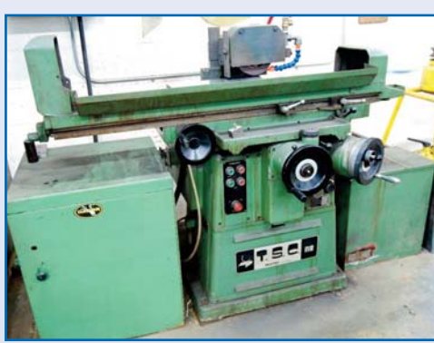
TSC NB SURFACE SURFACE GRINDER, 9" X 20"