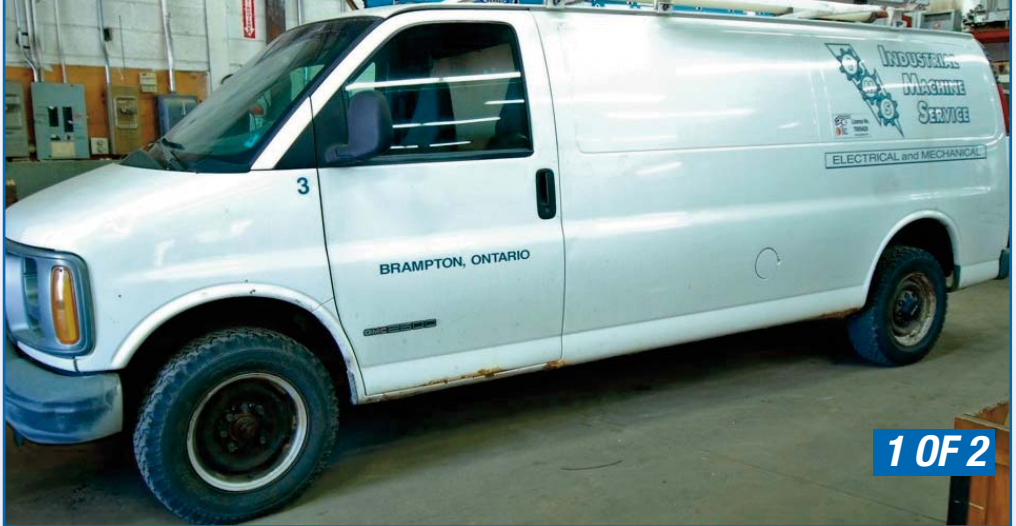
GMC 2500 SERVICE VAN'

PHOEBUS P3M-GEVS500A VERTICAL MILLING MACHINE