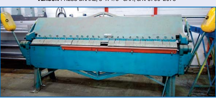
CHICAGO L37 BOX & PAN BRAKE, 8' X 12GA CAP., S/N 101367