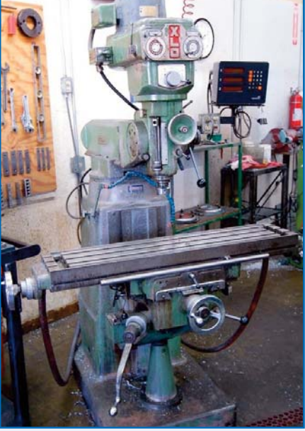
EX-CELL-O XLO VERTICAL MILLING MACHINE, 9" X 42" TABLE, 3-AXIS DRO